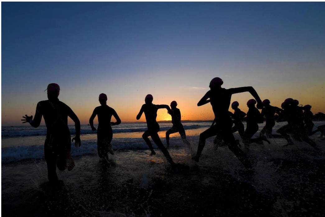
Devonport Triathlon February 29 th 2020.