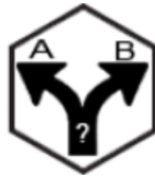
Ethical Decision Making - Starter Course