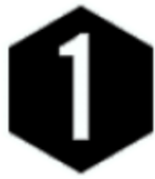
ASADA Anti-Doping Level 1 Course