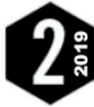
ASADA Level 2 Anti- Doping Course - 2019